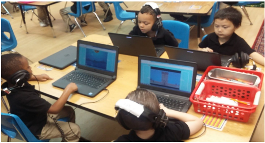
21st Century Teaching and Learning